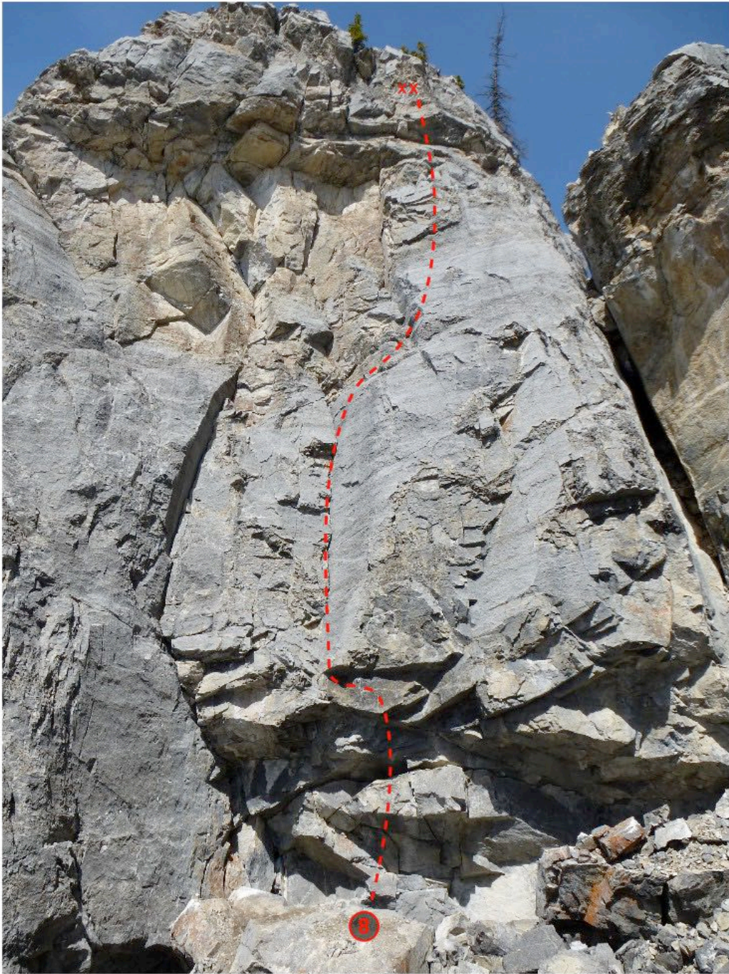
8) Corridor Route – 10a, 18m