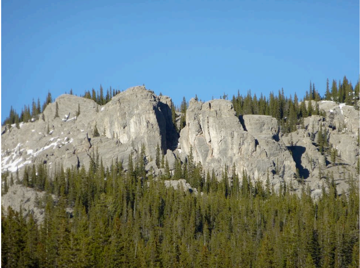
The Andrea's Pillars as viewed from the Sentinel Cliff parking area

While putting up some new routes in the fall of 2011 at the north facing Sentinel Cliff Andrea turned around and saw some rock pillars sticking out on the lower part of Black Rock Mountain sitting in the warm sunshine. Two days later we were standing below the formations realizing that there was potential for some nice single pitch climbs. Several obvious cracks stood out with possible face climbs in between. The sector offers nice views looking looking down into the North Ghost towards Mt Aylmer. The routes face three aspects: east, west and south, but the wind can be a problem on this exposed ridge. During the fringe seasons spring and fall windy days could prove to be cold.